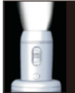
Power Failure Light